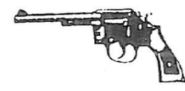
LONG BARREL REVOLVER